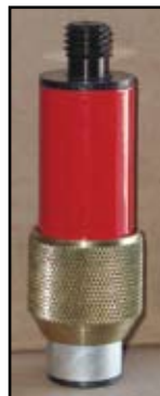
Part # P161461-2515 Mini Rod Adapter for the GPS fixed height 2 meter rods.

3- Next (this will probably take two people) Screw in the white plastic bolt "adapter" into the bottom of the U-joint. Hang plumb bob and gammon reel from adaptor to help line top part of the True Plumb with the bottom part of True Plumb. Attach the top section of the True Plumb to the wall so there is at least 5 feet 2 inches between the bottom of the U-joint and top of bottom adjusting plate of the bottom section. Level and mount with two screws provided. Note: if you think you might use it for GPS fix height 2 meter rod the distance is 7 ft. between U-joint and bottom plate.